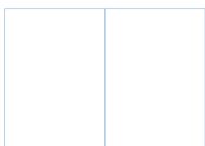
Full Page Spread